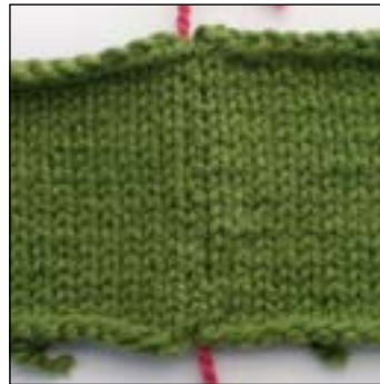
Mattress Stitch: page 5