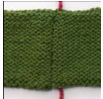
Mattress Stitch on Reverse Stockinette Stitch: page 6