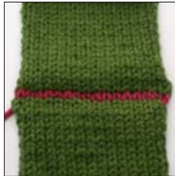
Shoulder Seam Graft: page 4