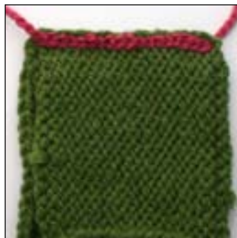
Slip-Stitch Crochet Seam: page 8