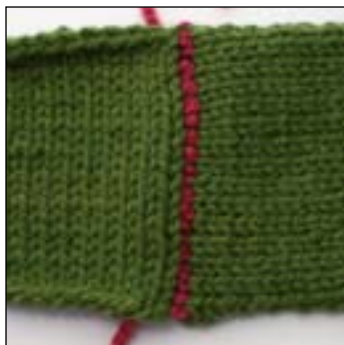
Mattress Stitch/Graft Combo: page 7