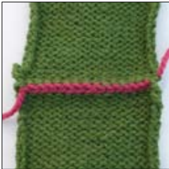
Three-Needle Bind-Off: page 3

The original article In Praise of Seams by Sandi Rosner was posted in Twist Collective's Fall 2011 issue .