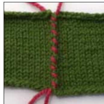
Inside-Out Seam: page 9