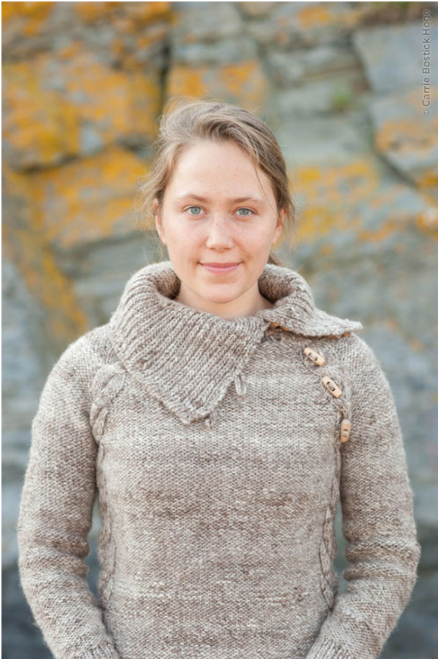
Toggles in the cables! Brilliant. Let's have another look.