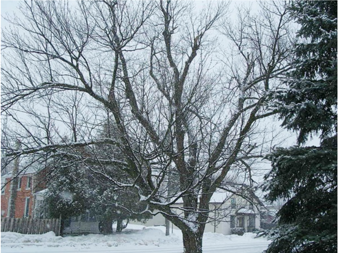
A snowy day in Athens, Ontario

With my head up and eyes closed, I could feel the cold snow flake on my face and in that moment I'm in the Lantern field in Narnia and I'm in the forest of Snow Queen.