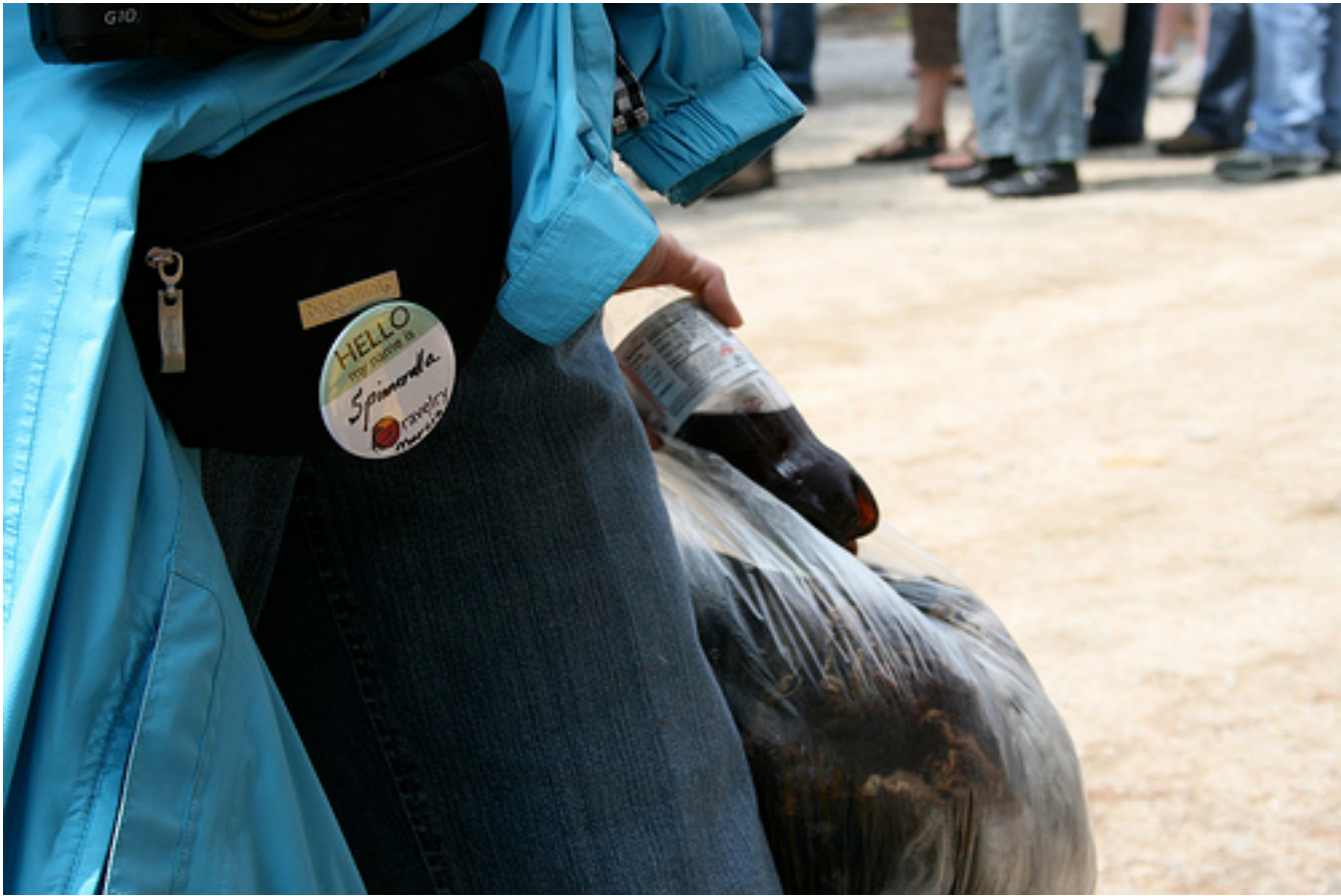
Tribal badges and