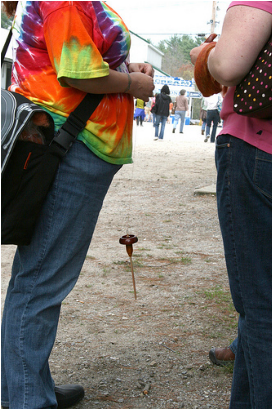
Drop spindlers devoted to vivid color