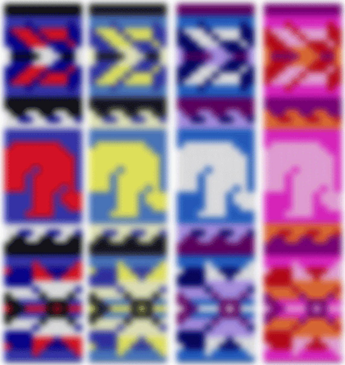
Just the tip of the iceberg, my darlings!