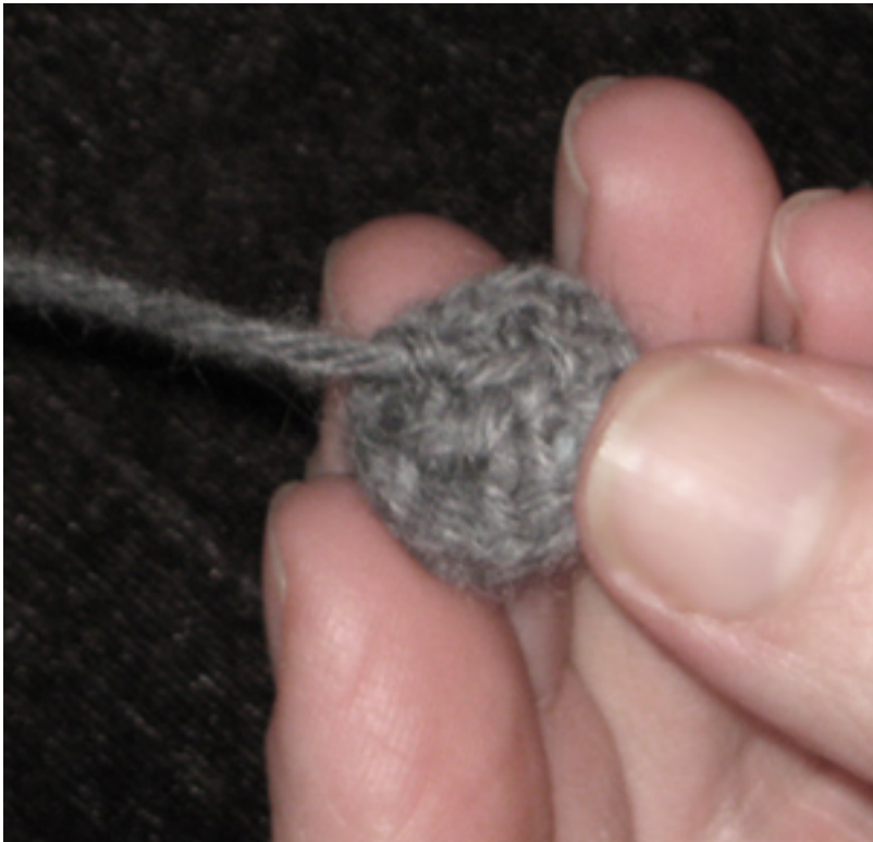
As you've come this far, the only thing left is to wear and enjoy!