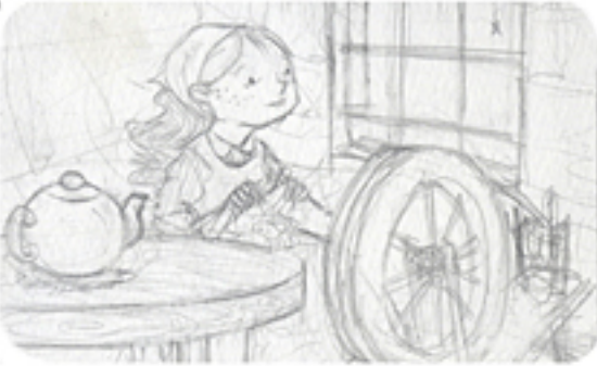
Thus, she would sit in her little chair by the window and spin or knit.