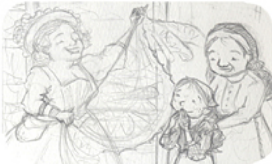
There on the threshold stood a beautiful lady dressed in the finest silks and satins.