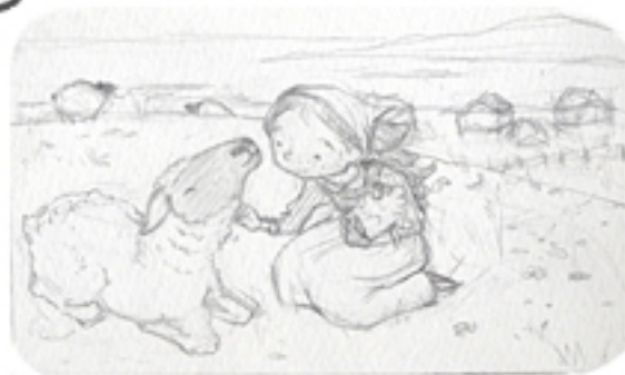
The next morning Maryate pulled the whitest wool from the jundies and set to work.