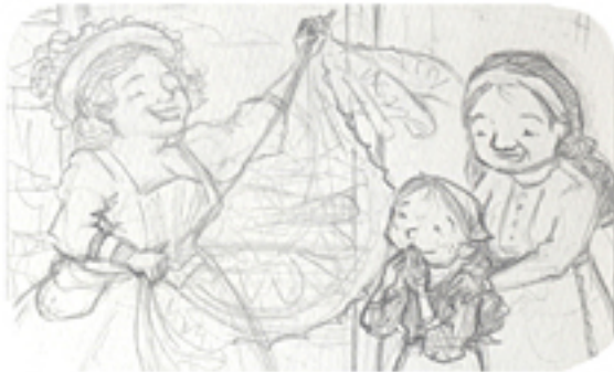
There on the threshold stood a beautiful lady dressed in the finest silks and satins.