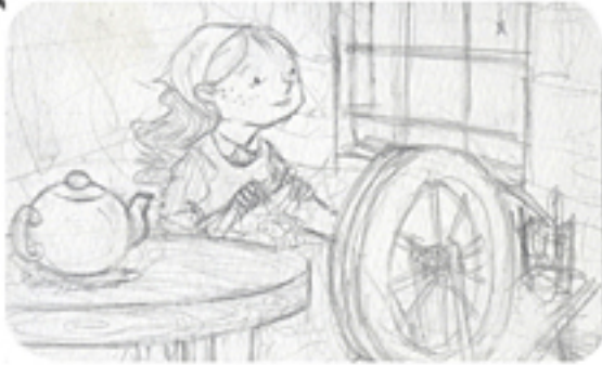
Thus, she would sit in her little chair by the window and spin or knit.