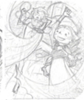
"Watch me, Maryate, and I shall teach you to spin and knit more beautifully than you ever thought possible."