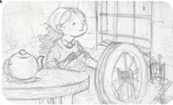
Thus, she would sit in her little chair by the window and spin or knit.