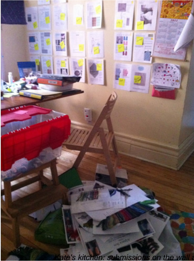
Kate's kitchen: submissions on the wall and color cards everywhere

The final step in the submissions process is yarn assignment.