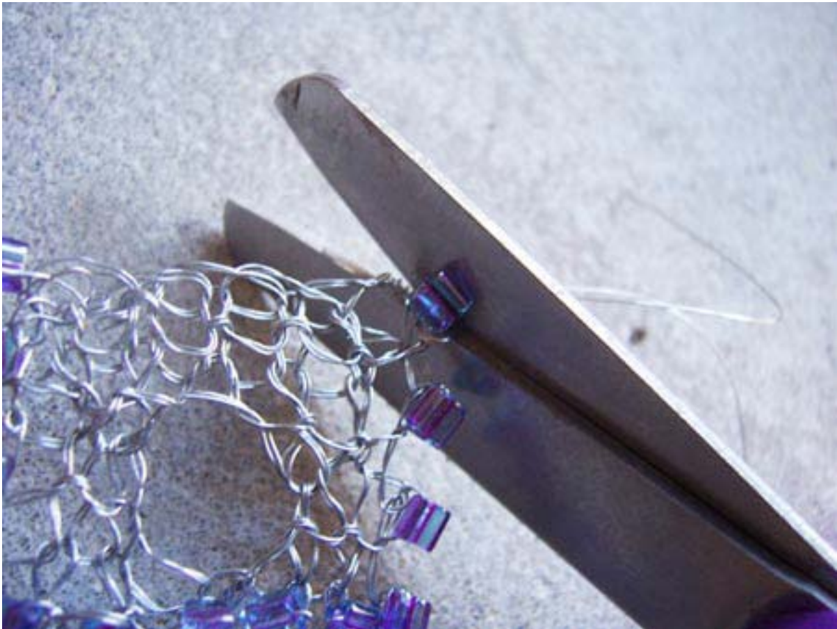
Adding findings: Clasps, earring wires, jump rings and the like are called "findings." When you wish to attach a finding, it is important to secure it properly so that you do not put undue stress on thin wire. My designs are engineered to distribute stress over a larger area and cut down on metal fatigue so that the piece will last longer. The necklace shown here uses a ribbon closure to side-step this issue completely. The pieces in my book employ several different methods of closure.