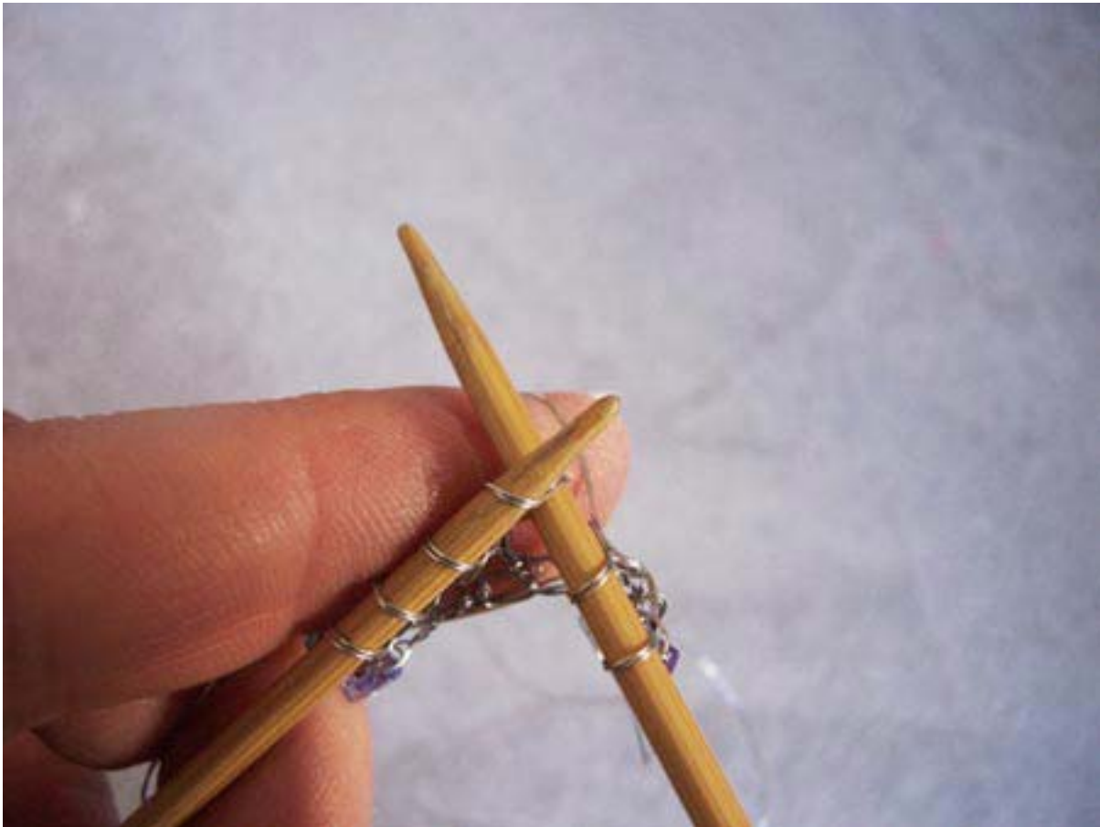
Placing beads: I always pre-string beads and place them between stitches. When knitting with two strands of wire, it is only necessary to string beads on one of the strands. Where beads are placed on edges, it is often necessary to push and pull the beads into place. Happily, though, wire stays where you put it! Alternatively, beads with fairly large holes may be placed over the stitch using a crochet hook. I wouldn't suggest this with the smaller ones, though, as the wire may break under stress.