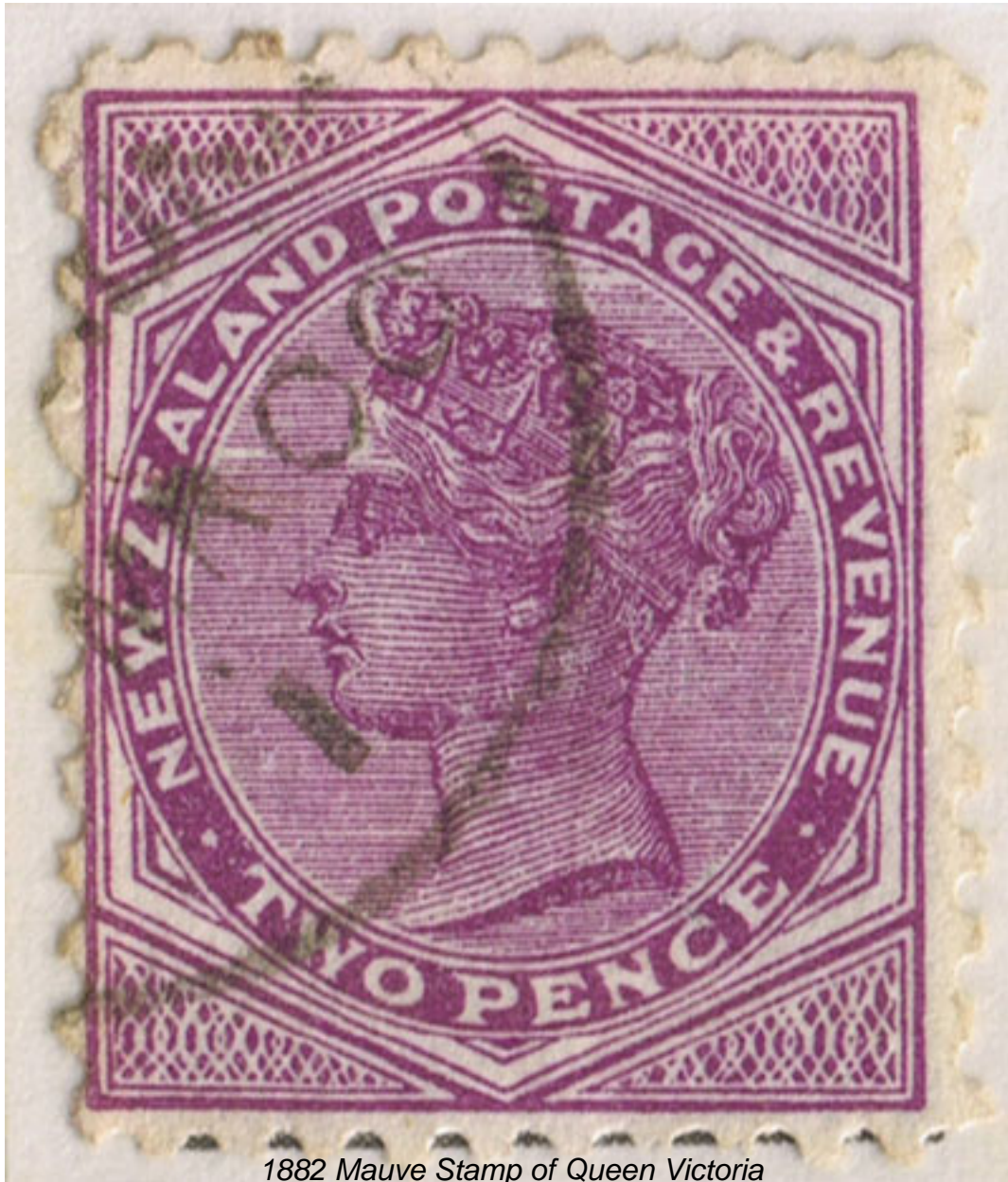
1882 Mauve Stamp of Queen Victoria

Superstitions about purple have continued into the modern day. In Italy, opera singers avoid wearing purple on stage because doing so is viewed as a slight to the church. (In days gone by the use and wearing of purple was reserved for the Pope.) Singers avoid wearing the color for auditions, believing it to be an unconscious signal that they are out of work. Look closely in TV and film, and you'll note that characters wear purple shortly before they meet their demise.