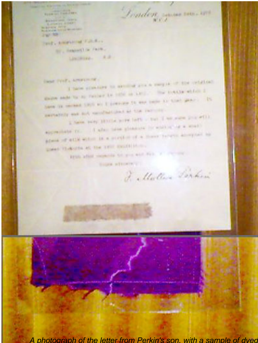
A photograph of the letter from Perkin's son, with a sample of dyed silk.

Thanks to factory production, the shade once reserved for only the very wealthy was now in the hands (and clothing) of the masses. But with the introduction of more aniline dyes (fuchsine, safranin and induline, to name just a few), mauve eventually fell out of fashion favor. Mauve began to be associated with death—thanks to both to the poisonous nature of the aniline dyes used to create it and Queen Victoria's decision to wear the color during the half-mourning for her