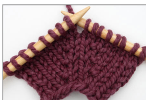
Knit in the Front and Back of the Stitch