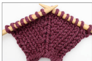
Lifted Increases (Left or Right)