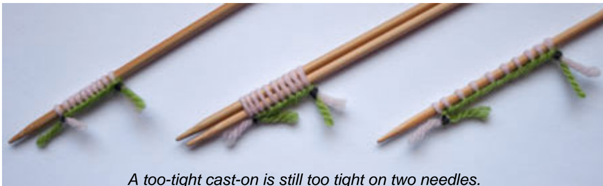
A too-tight cast-on is still too tight on two needles.

Take a look at these pictures. In this photo, you see ten stitches cast on over one needle and over two needles. The green yarn wrapping the base of each stitch is the tail yarn. I've marked the yarn at the beginning and end of the cast-on. The needle on the far right shows a single-needle cast on with more space between the stitches (more on that later).