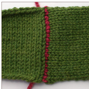
Mattress Stitch/Graft Combo