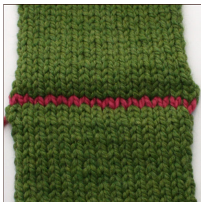
Shoulder Seam Graft