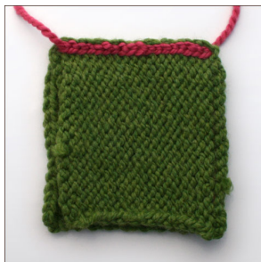
Slip-Stitch Crochet Seam