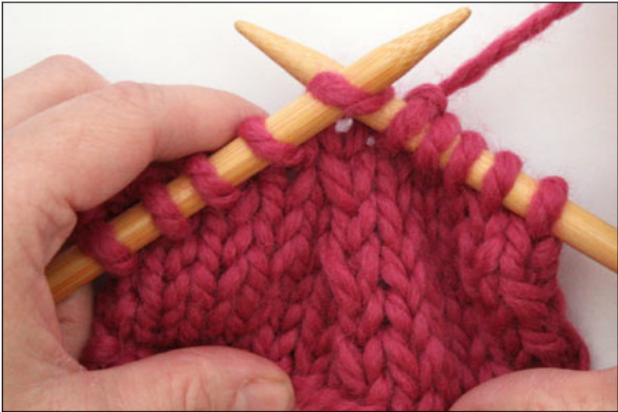
Slip one stitch as if to knit.