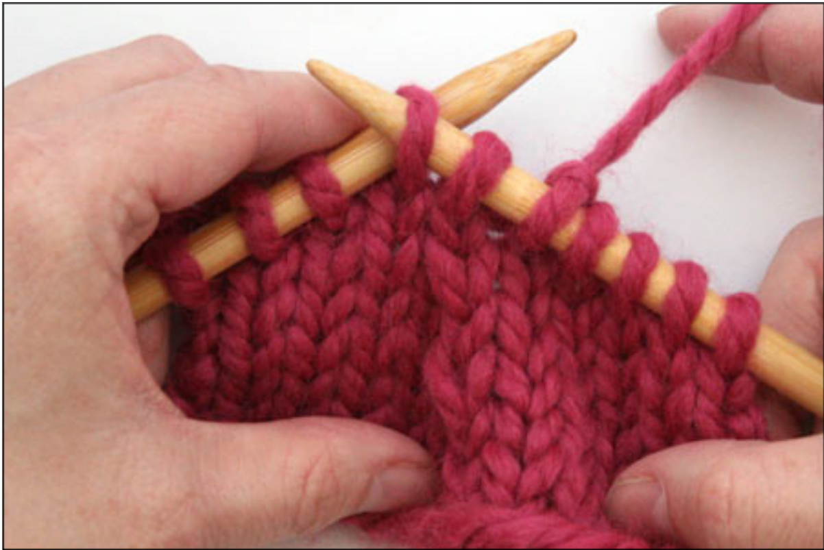
Slip a second stitch as if to purl.