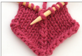
Centered Double Decrease