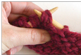
Knit Three Together