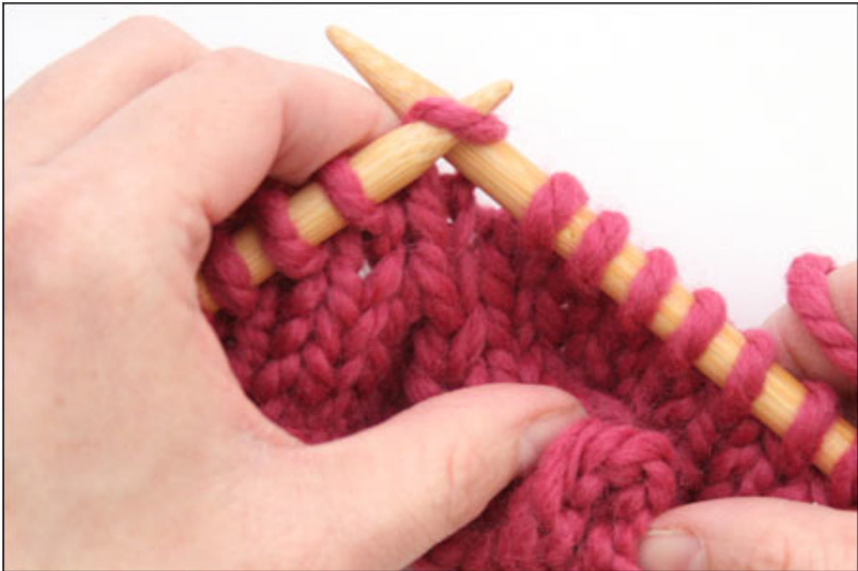
Slip one stitch as if to knit.