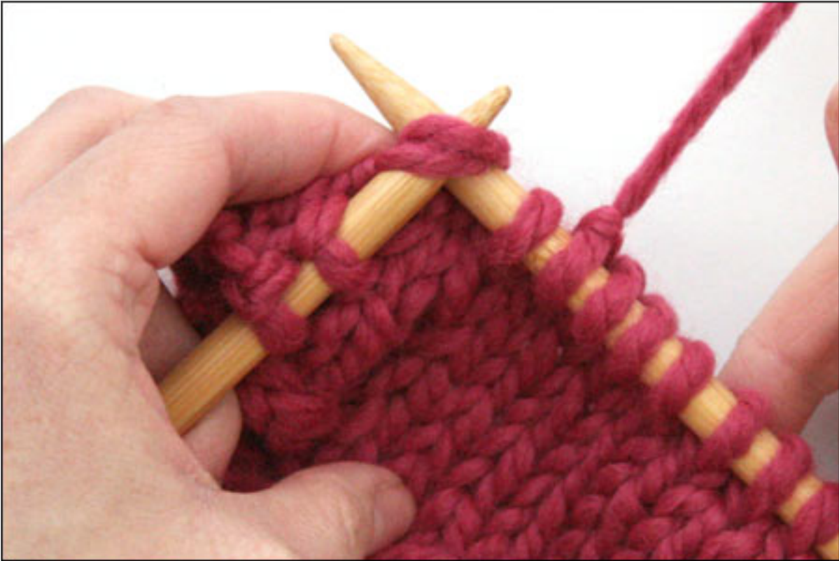
Knit two stitches together.