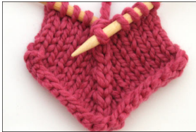
Centered Double Decrease

Read the full article, Decoding Decreases