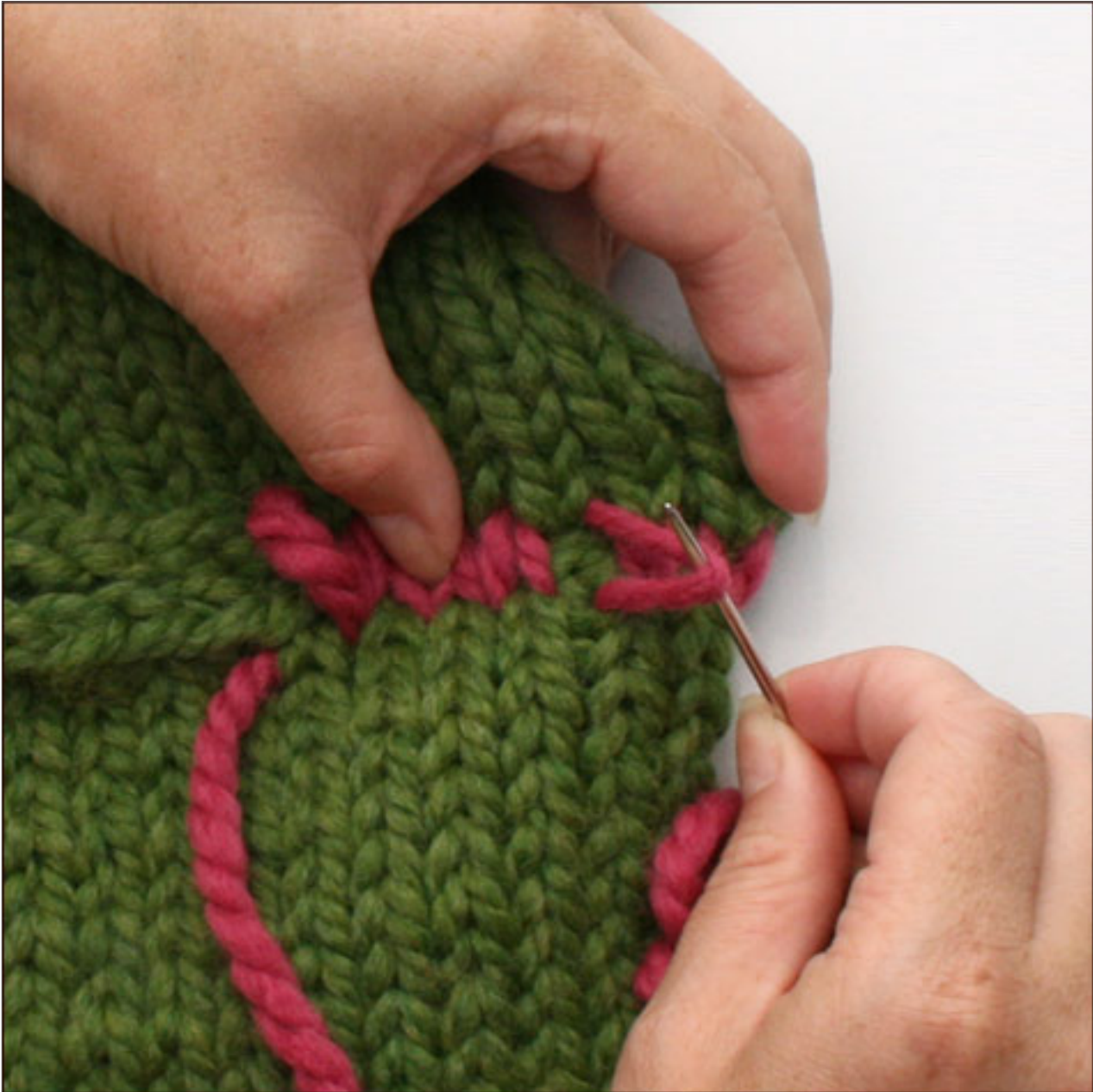
Adjust the tension of your graft to match that of the surrounding stitches.