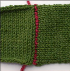
Mattress Stitch/Graft Combo