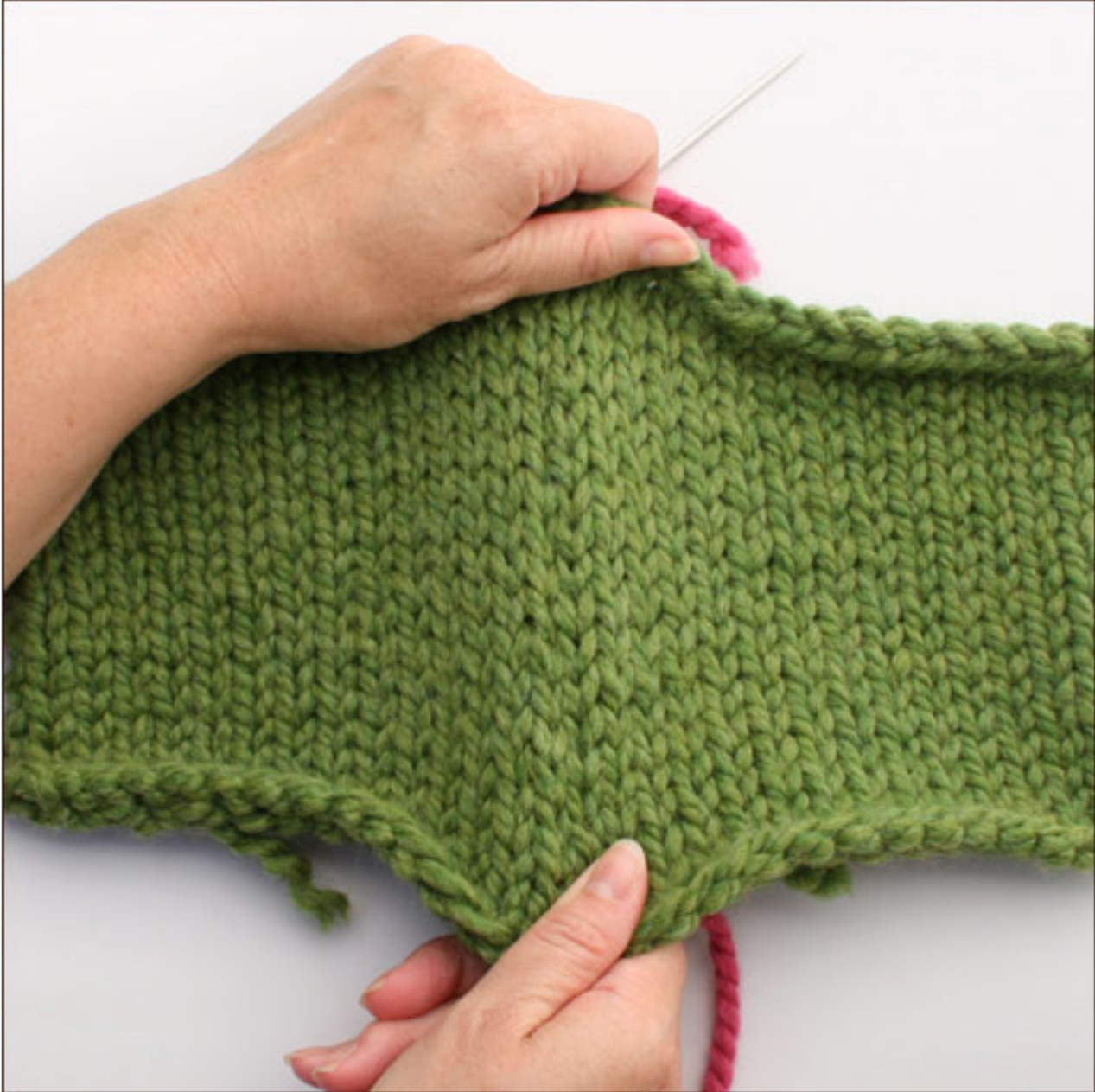
Then stretch the seam lengthwise to give it a little ease.