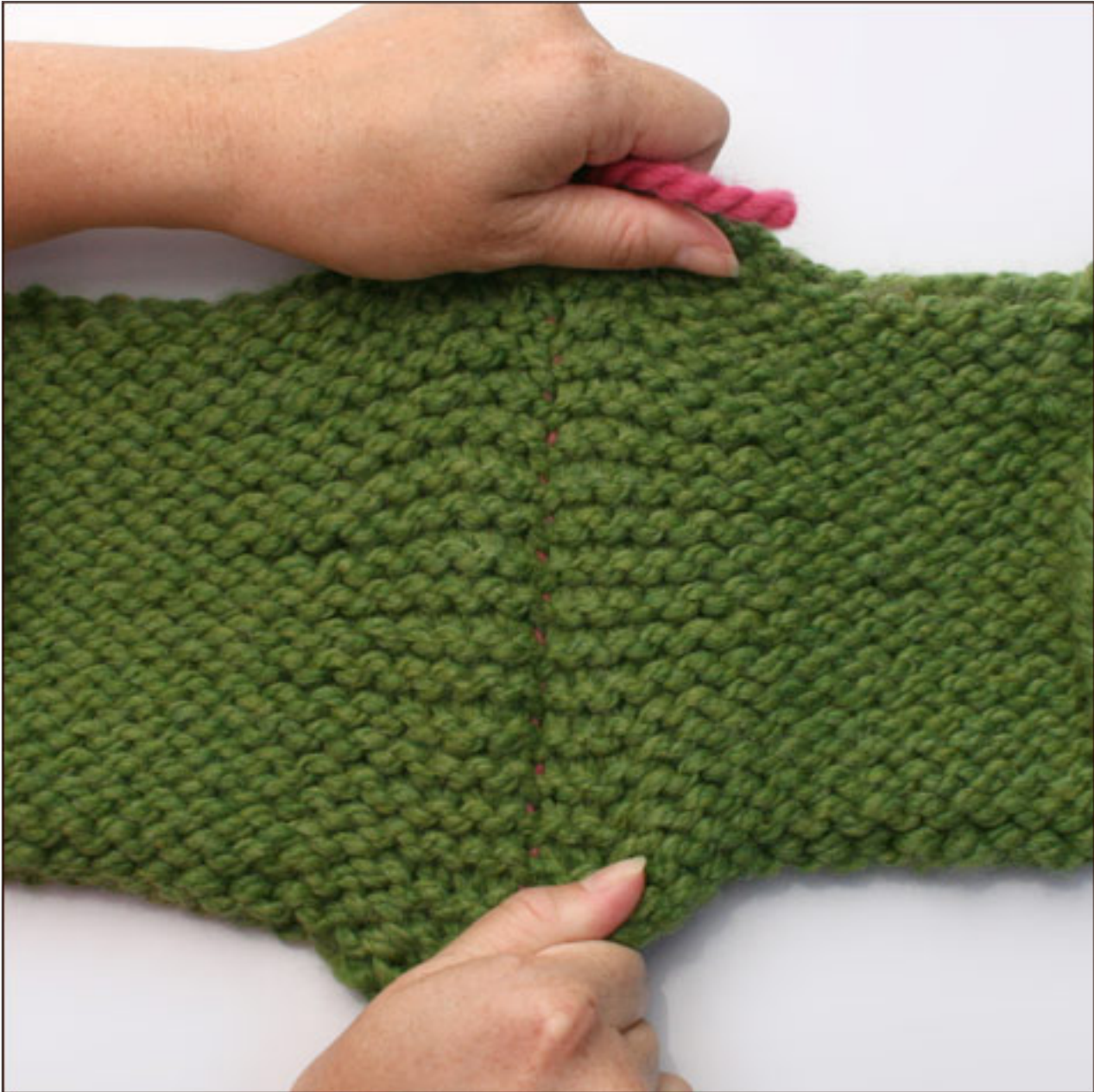
Then stretch the seam lengthwise to give it a little ease.