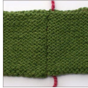
Mattress Stitch on Reverse Stockinette Stitch