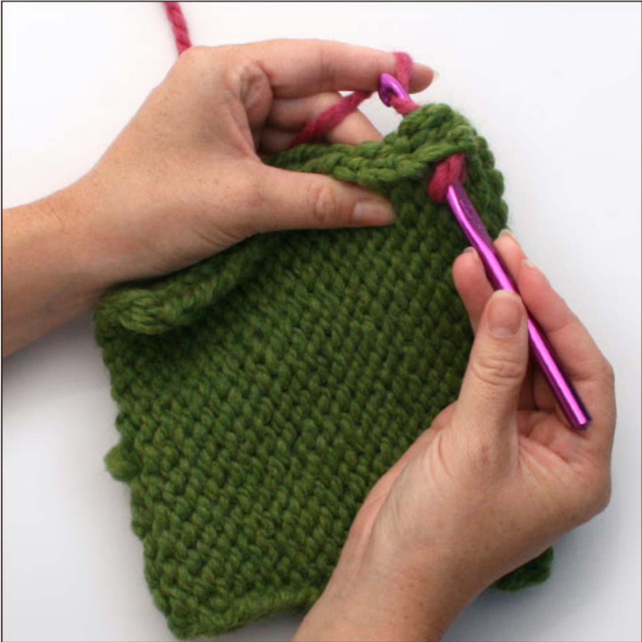
3. Insert the crochet hook through both layers of knitting a row or two further along...