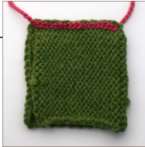
Slip-Stitch Crochet Seam