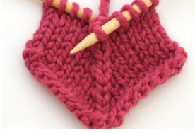
Centered Double Decrease

Published on Sunday, 01 April 2012 21:11