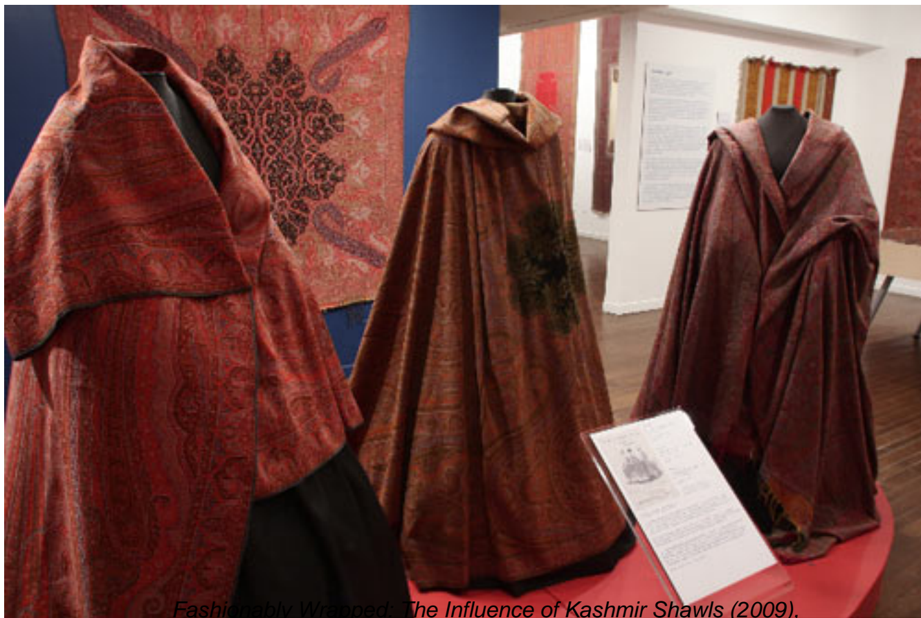
Fashionably Wrapped: The Influence of Kashmir Shawls (2009), Textile Museum of Canada .

During the nineteenth century technological advancements in Jacquard loom weaving wielded its influence over paisley design. Older looms limited paisley patterns to five to six inches (12 to 15 centimeters) in size, but the more modern looms made it possible for one repeat to cover the whole shawl. This ability to create a larger design tied in quite nicely to the changing silhouette of women's dress. At the beginning of the century an artistically draped shawl added interest to the simple silhouette of the Empire-line gown. But as waistlines fell and the leg-o-mutton sleeve ballooned into vogue, the shawl, folded carefully to display all four borders, created a pleasing silhouette that emphasized the shoulders. The ever-increasing width of crinoline skirts had ladies discarding their coats and donning shawls for warmth as well as fashion. The large centered motifs, made possible by the new looms, were shown to their best advantage over such a wide expanse.